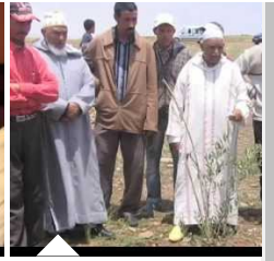
High Atlas Four overview