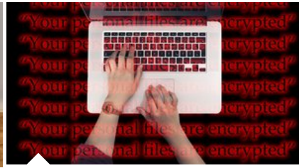
US Cyber Command Blocked Internet Research Agency's Web Access During 2018 Midterms