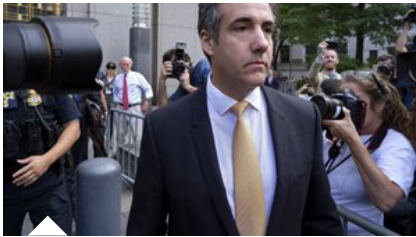
Cohen Expected to Tell Senators About Trump- Russia Contacts