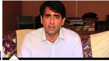
High Atlas Foundation Call for Donors