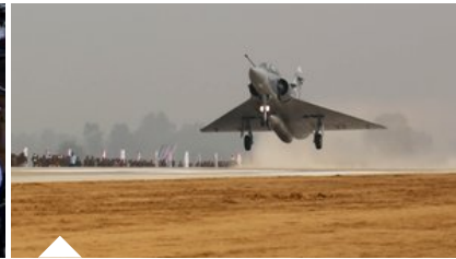
2 Indian aircraft violating Pakistani airspace shot down; 2 pilots arrested