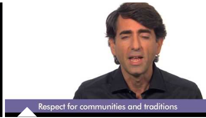
High Atlas Foundation - Questions & Answers